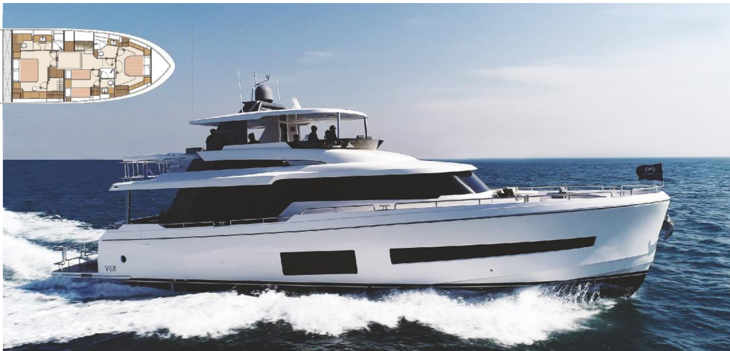
A plumb bow and covered side-decks give the Horizon V68 real presence

LENGTH 68ft 5in (20.87m) BEAM 19ft 6in (6.0m) ENGINES Twin CAT C18 1,136hp TOP SPEED 25 knots PRICE FROM €3.07m ex VAT CONTACT Horizon Yachts Europe +34 971 673 508; www.horizonyacht.com