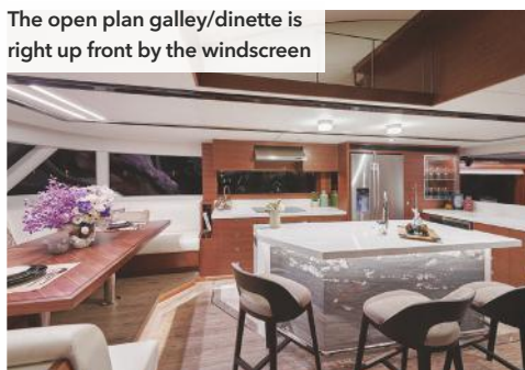
The open plan galley/dinette is right up front by the windscreen