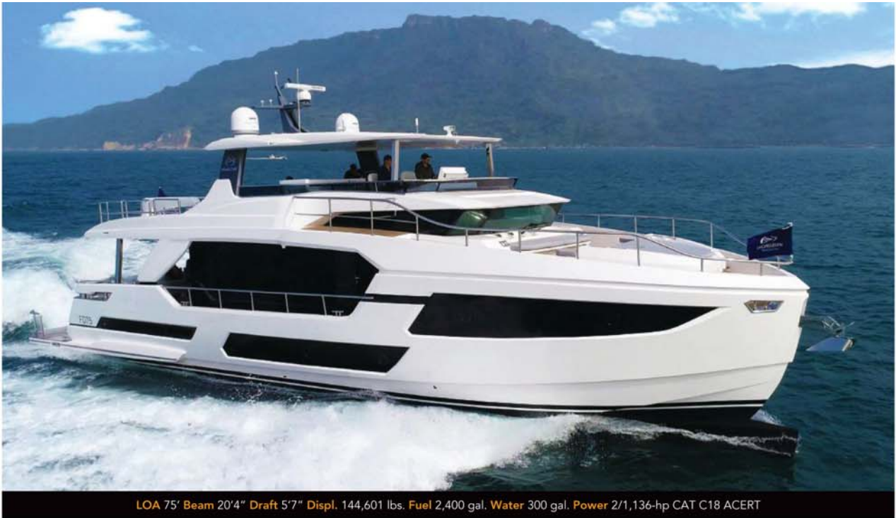
LOA 75' Beam 20'4" Draft 5'7" Displ. 144,601 lbs. Fuel 2,400 gal. Water 300 gal. Power 2/1,136-hp CAT C18 ACERT