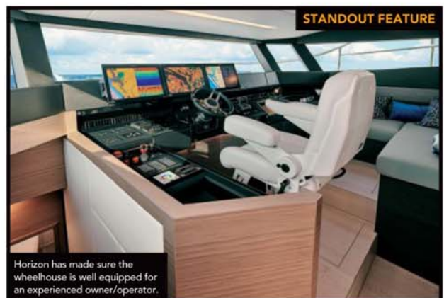
Horizon has made sure the wheelhouse is well equipped for an experienced owner/operator.